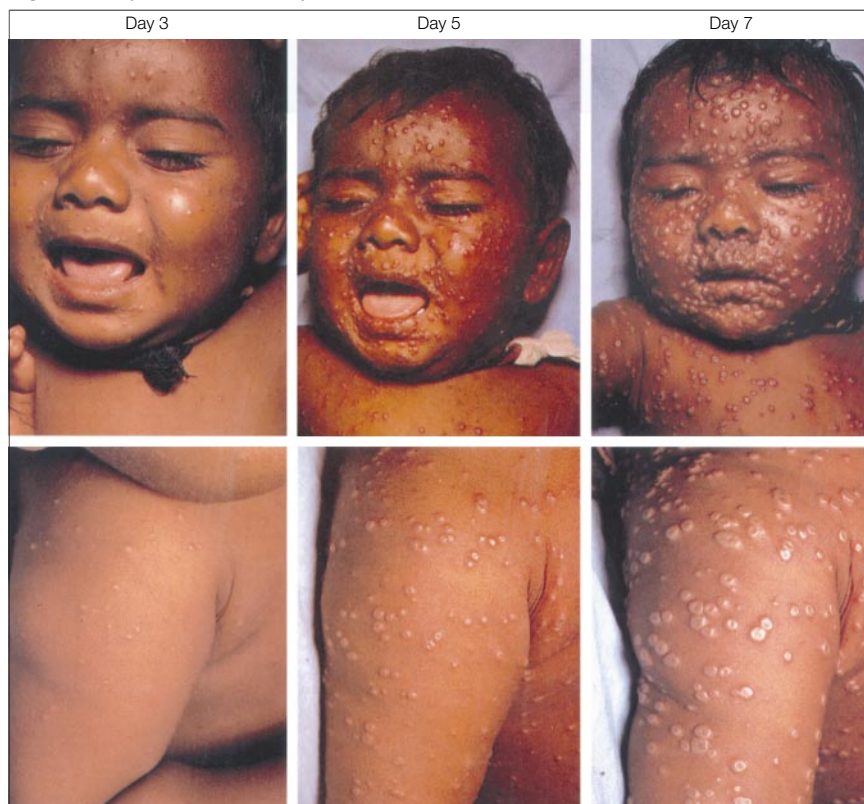
Figure 2. Typical Case of Smallpox Infection in a Child

Figure shows the appearance of the rash at days 3, 5, and 7 of evolution. Note that lesions are more dense on the face and extremities than on the trunk; that they appear on the palms of the hand; and that they are similar in appearance to each other. If this were a case of chickenpox, one would expect to see, in any area, macules, papules, pustules, and lesions with scabs. 2